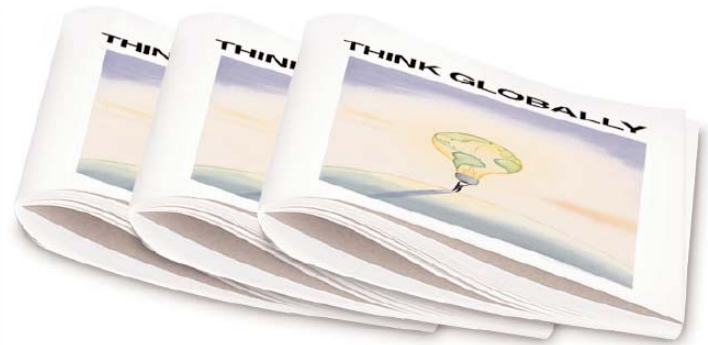
Produce professional-looking documents with either the Booklet Finisher, which folds and staples documents into complete books; or the 2,000-sheet Finisher that collates and staples documents.

The Gestetner C7435n can be configured with one of two wireless interfaces so you can print from virtually anywhere in the office.