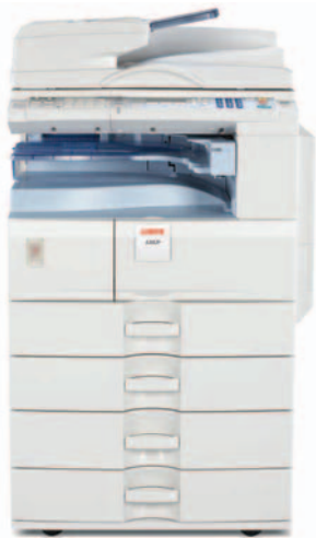
LD125 Standard Scan/Print/Fax Model*