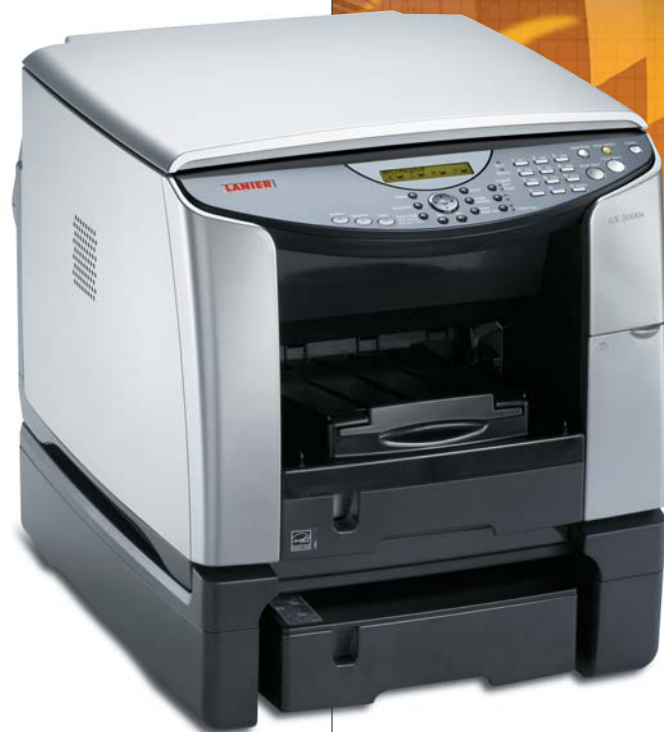
The Lanier GX3000s/ GX3000sF/GX3050sFN desktop color systems deliver high-quality color and true multifunctionality — for less.