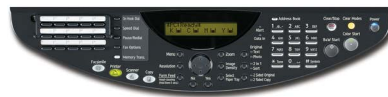
Set up print, copy, scan and fax* jobs in seconds with the intuitive control panel.