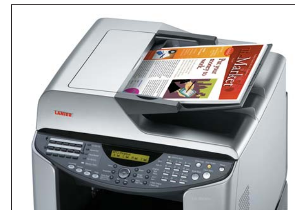
Handle any task — including full-color scanning and faxing* — with a single system.