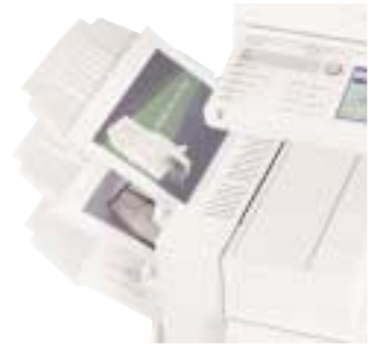
Separate copy, print and fax output with the optional Multi-Bin Output Tray.