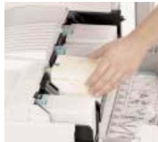
Routine maintenance is simplified with toner cartridges that quickly snap into place.