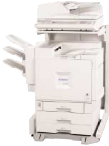
The DSc38S with optional Multi-Bin Output tray.

• Instantly route scanned documents to anyone on your network via ScanRouter V2 Lite. To further enhance the electronic document delivery process, upgrade to ScanRouter V2 Professional, which provides you with scan to e-mail capabilities and the ability to store incoming faxes directly to the Document Server.