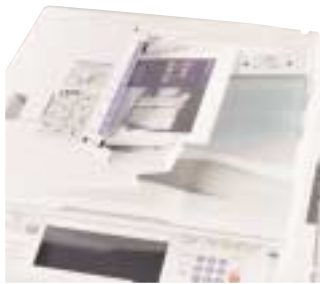
Use the ARDF or the platen glass to place originals for scanning.

• Instantly route scanned documents to anyone on your network via ScanRouter V2 Lite. To further enhance the electronic document delivery process, upgrade to ScanRouter V2 Professional, which provides you with scan to e-mail capabilities and the ability to store incoming faxes directly to the Document Server.